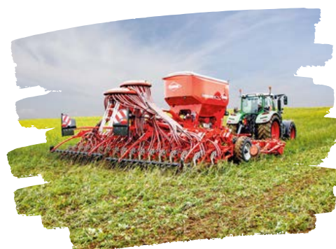
NO-TILL (DIRECT DRILLING)